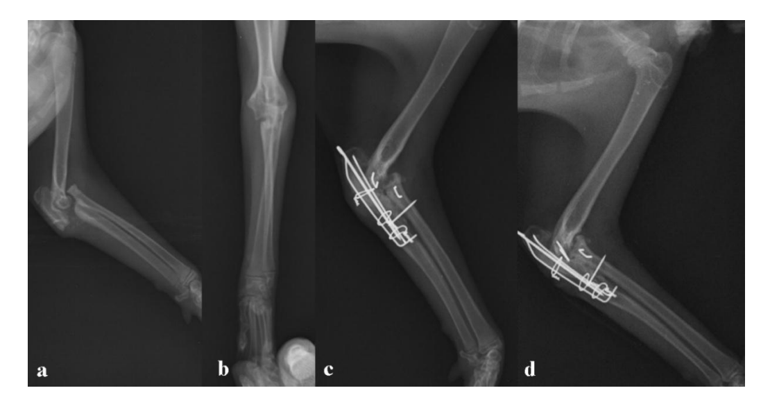
Figure 2. Case no 17 radiographs: a and b . preoperative, c postoperative day 30, d . postoperative day 61